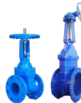
Rising Stem, OS&Y