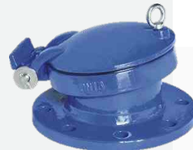
Flap Valve DN40-600