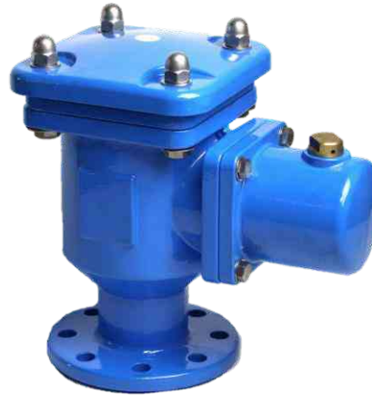
Double Orifice Triple function, ABS ball