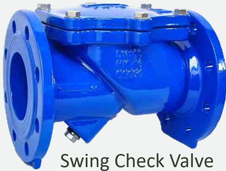
Swing Check Valve 45° Flexible DN50-700