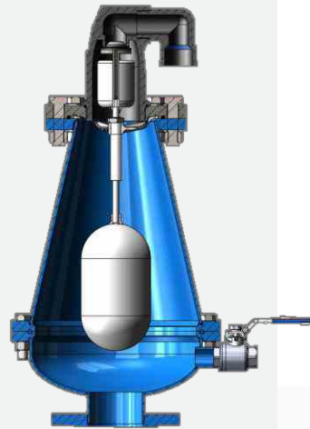
Sewage Air Valve