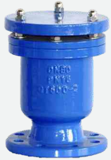
Single Orifice two function, SS304 ball