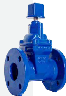
AWWA C515 RSGV