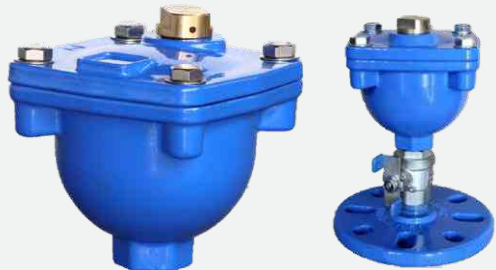
Single Orifice Air Valve, 1" c/w flange DN40-65