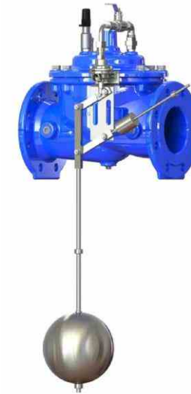
Float Valve Bi-lever