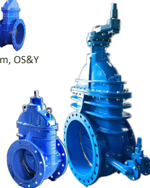
Metal Seated Gate Valve