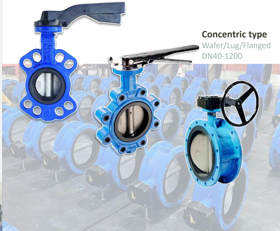
Concentric type Wafer/Lug/Flanged DN40-1200