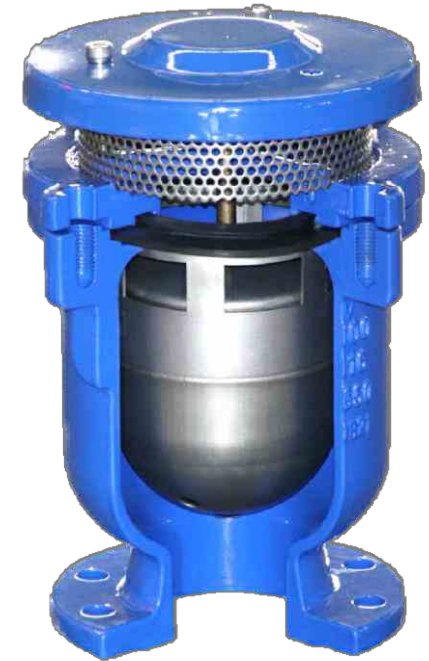
Nonslam Air Valve Combination, 4 functional