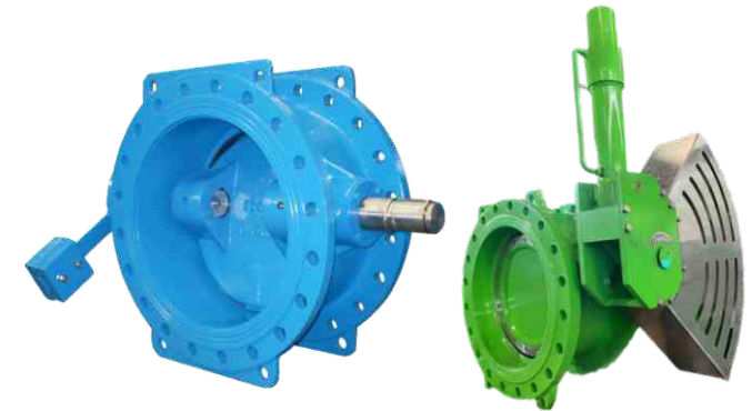
Titling Disc Check Valve