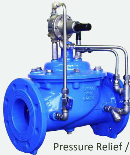
Pressure Relief / Sustaining Control Valve (PRSV)