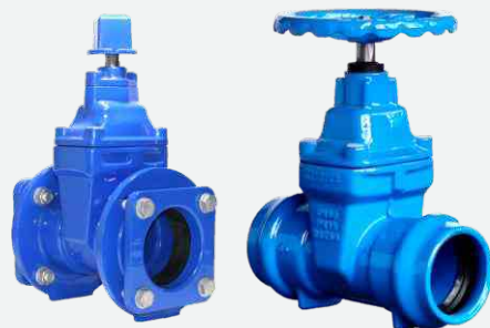
Socket end for PVC pipe