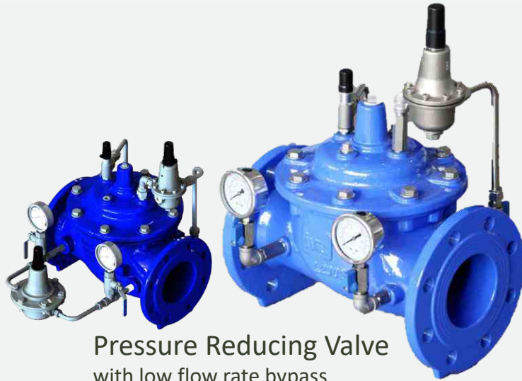
Pressure Reducing Valve with low flow rate bypass