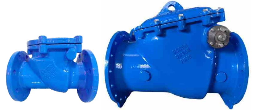
Swing Check Valve, DN50-700 Rubber seated/Metal seated