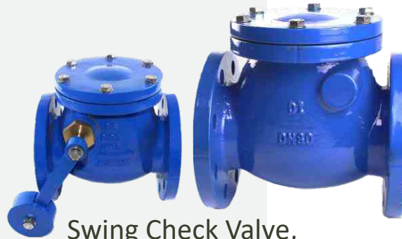
Swing Check Valve, DIN/BS/ANSI, DN50-900 Rubber seated/Metal seated