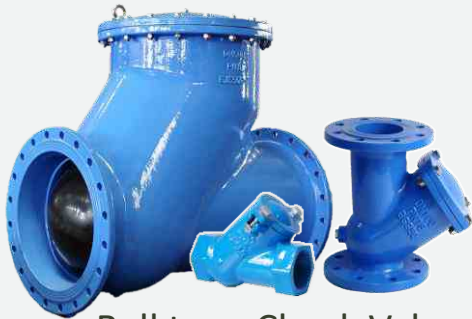
Ball type Check Valve flanged DN40-500 screwed DN28-80