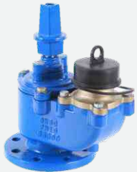
BS750 Hydrant Underground. DN80