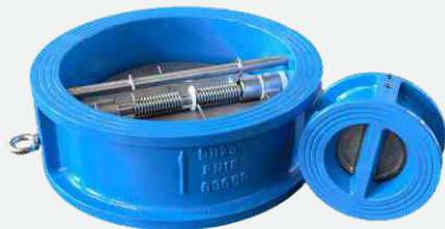
Wafer Check Valve Dual plate DN40-900