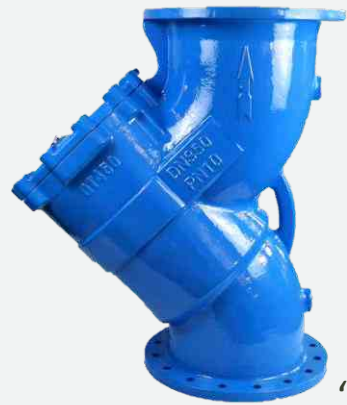
"Y" Strainer DN40-800