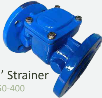
"T" Strainer DN50-400