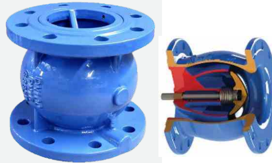
Vertical Silent Check Valve Nozzle nonslam Check Valve