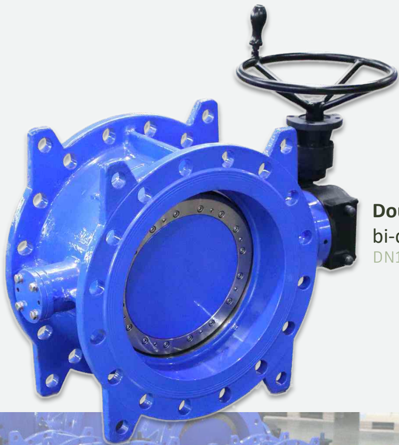
Double Eccentric bi-directional sealing DN100-2000