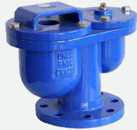
Double Orifice Triple function, SS304 ball