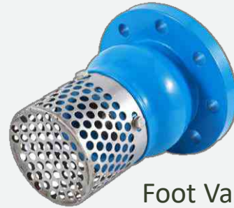
Foot Valve DN50-400