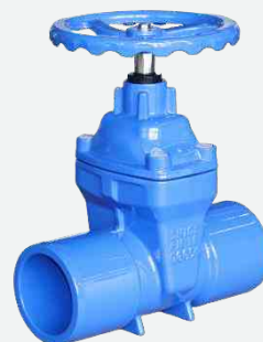
Spigot end. DN50-300